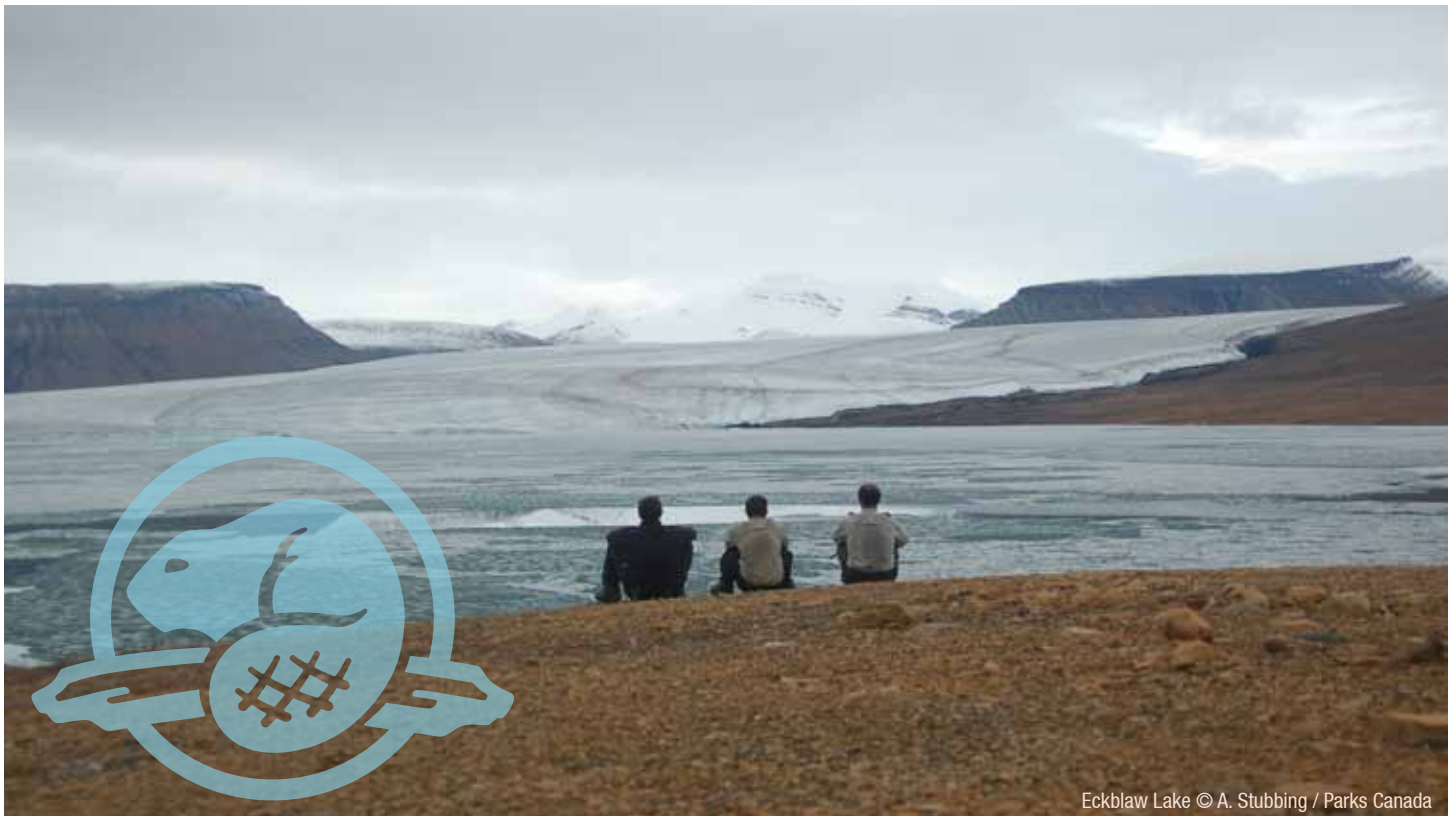
Eckblaw Lake