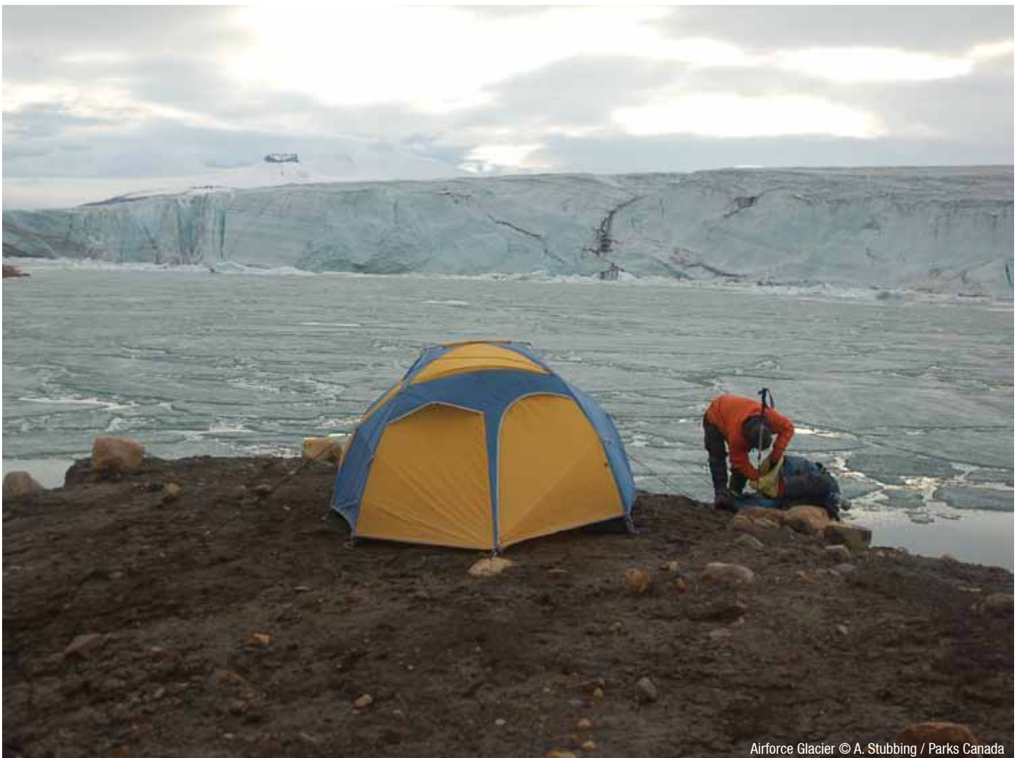
Airforce Glacier

These are the fees, at time of print. New Fees will soon be implemented. They are likely to be slightly higher.