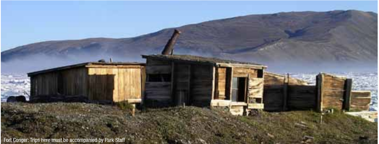
Fort Conger: Trips here must be accompanied by Park Staff

Your group should have advanced skills in wilderness first aid and be prepared to handle any medical, wildlife or weather related emergency. If someone in your group is uncertain about their skill level, consider travelling with an experienced guide. Contact information can be found in this package.