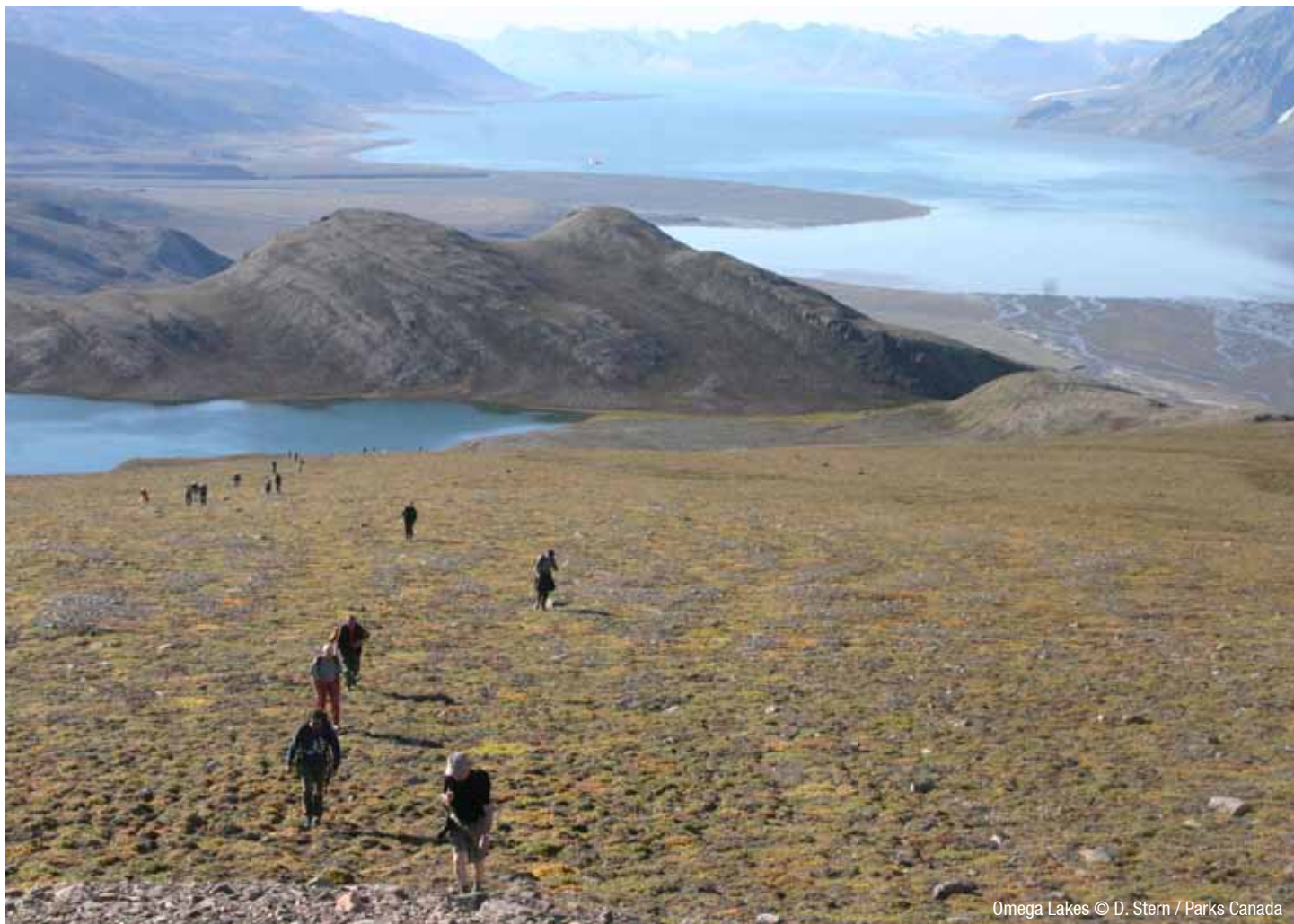
Omega Lakes

Many groups choose to hike a 9-10 day loop from Tanquary Fiord around the Ad Astra and Viking Ice Caps or a 11-12 day hike from Tanquary Fiord to Lake Hazen following the MacDonald and Very River Valleys.